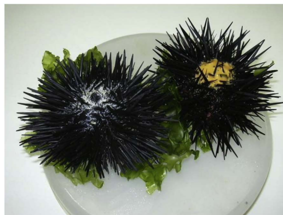
Fig. 1. Determining sex from the color of the gametes being released. Male is white, female is orange. (For interpretation of the references to colour in this figure legend, the reader is referred to the web version of this article.)

Gamete release was induced by injecting 2–4 mL of 0.5 M potassium chloride (KCl) into the perioral region of each animal (Standard ABNT No. 15350/2012). Animals were placed upside down over beakers containing either artificial seawater or autoclaved artificial seawater and left until spawning. Once spawning, sex was determined from the color of the gametes being released (sperm = white, oocytes = orange, Fig. 1). Males were removed from the water once spawning had begun and sperm collected as concentrated as possible from the aboral region