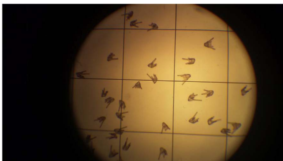
Fig. 3. Optical microscope image after 30 h incubation of fresh material fertilization on development embryo-larval test on a Sedgewick Rafter Chamber.